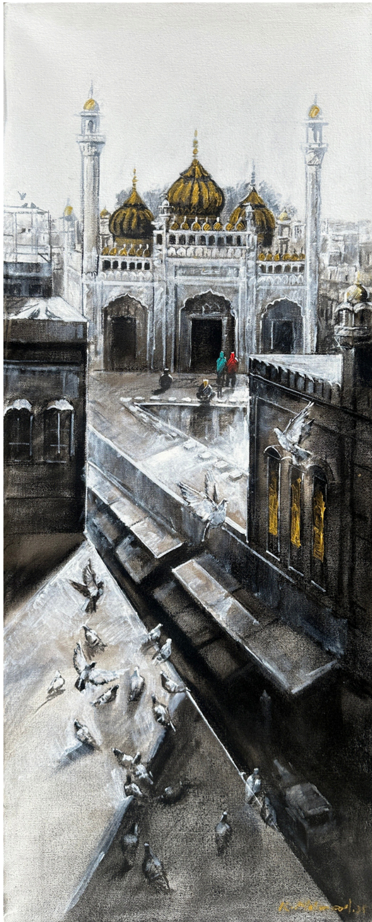
Pigeons and Gold: Sunehri Masjid 12 x 30 inches - Charcoal & Acrylic on Canvas