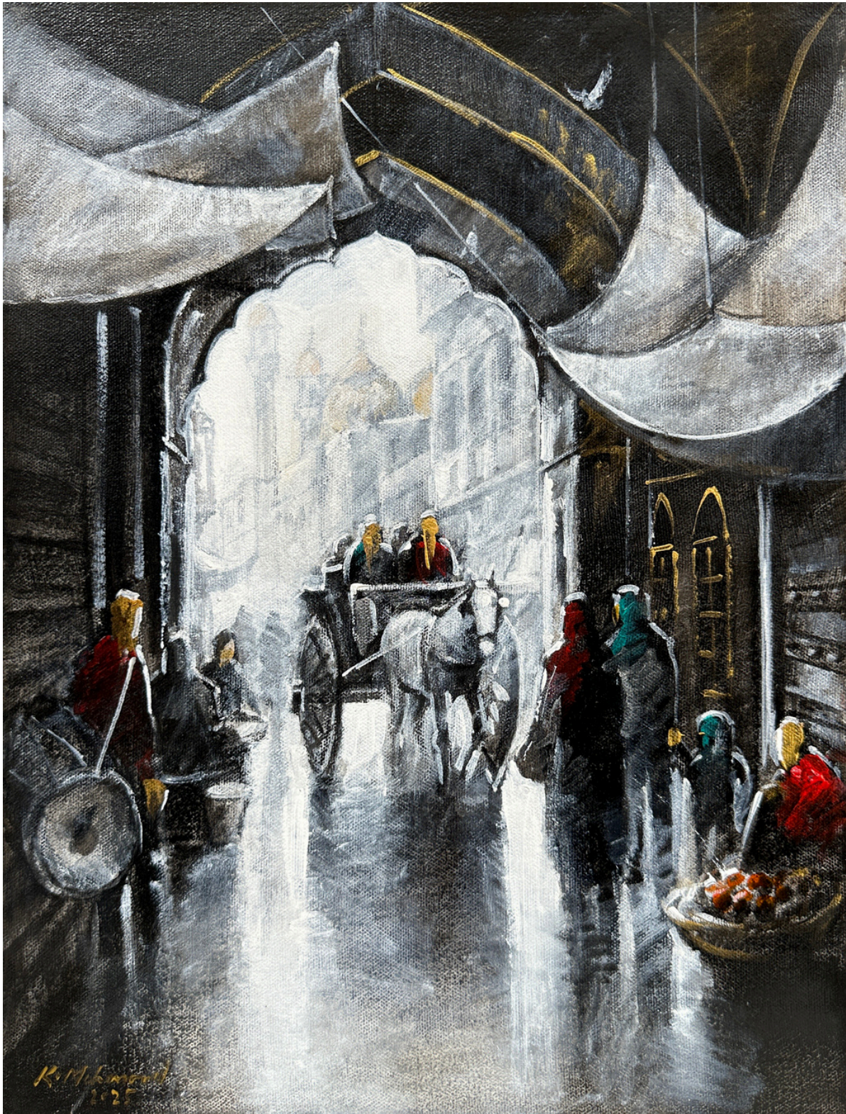
A Passage Through Lohari Gate 12 x 16 inches - Charcoal & Acrylic on Canvas