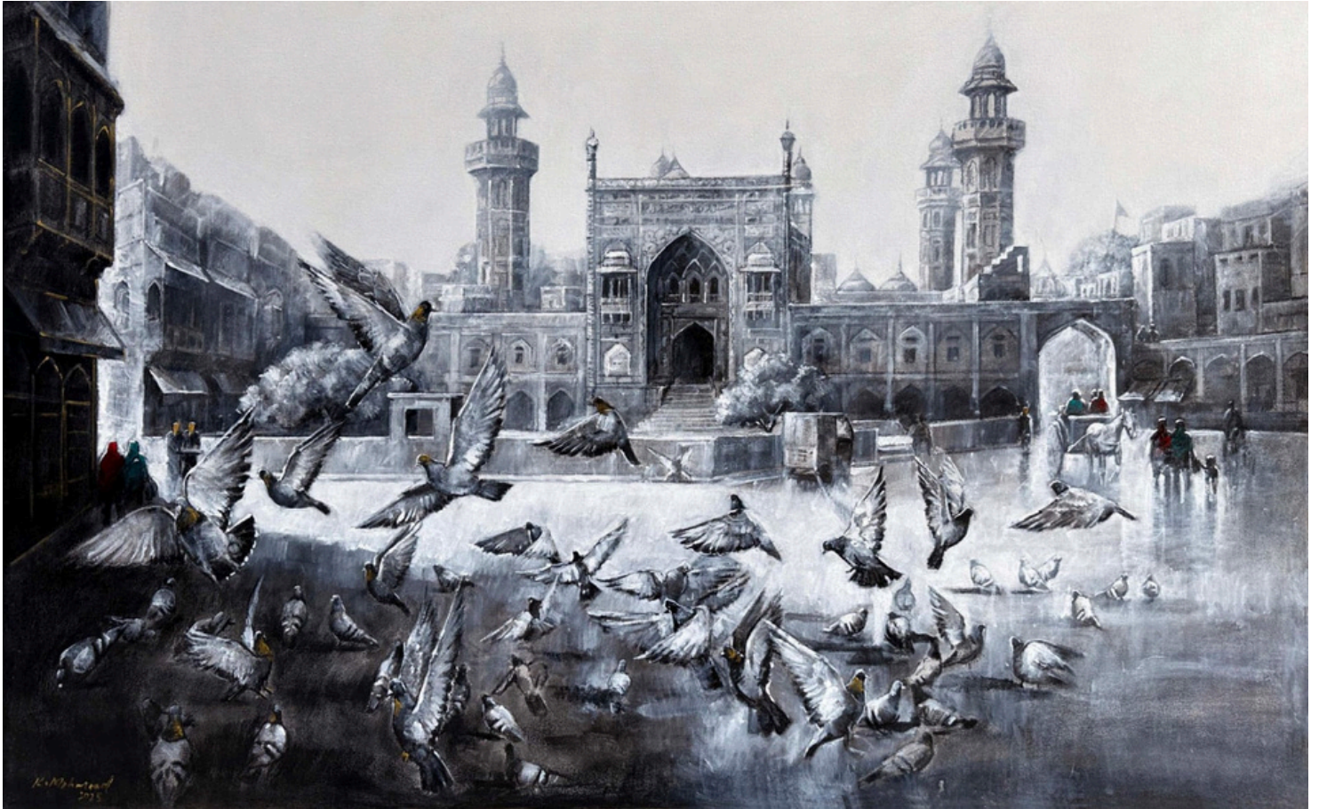
Wazir Khan and the Whispering Flock 30 x 48 inches - Charcoal & Acrylic on Canvas