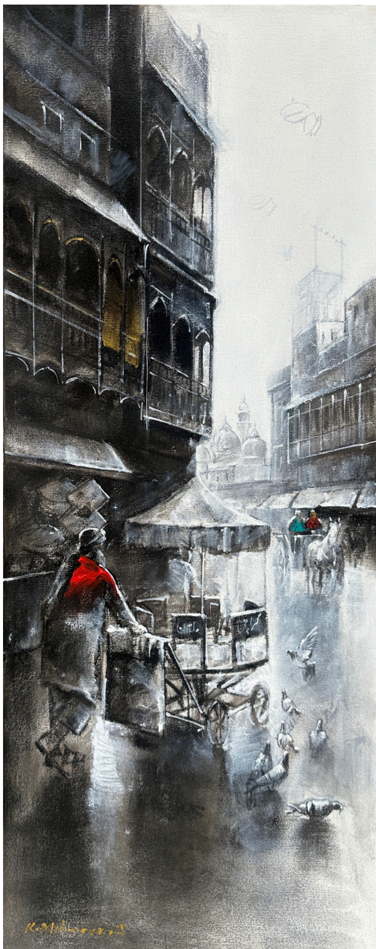
Pigeons and Gold: Sunehri Masjid II 12 x 30 inches - Charcoal & Acrylic on Canvas