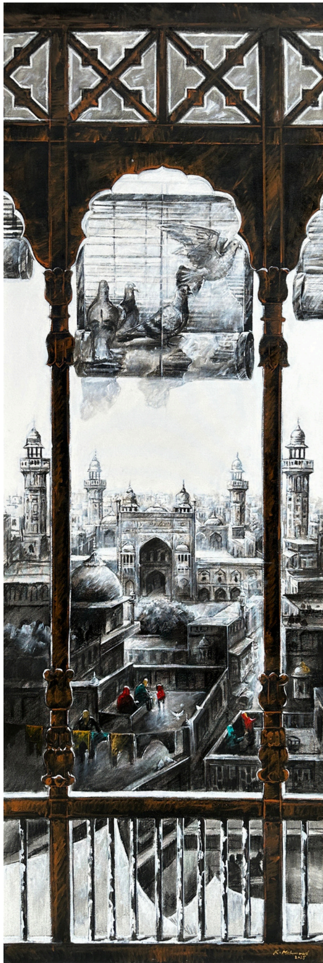
Wazir Khan: A Jharokha View

24 x 72 inches - Charcoal & Acrylic on Canvas