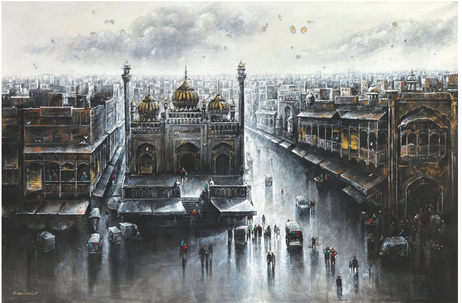
The Luminous Heart of Old Lahore 48 x 72 inches - Charcoal & Acrylic on Canvas