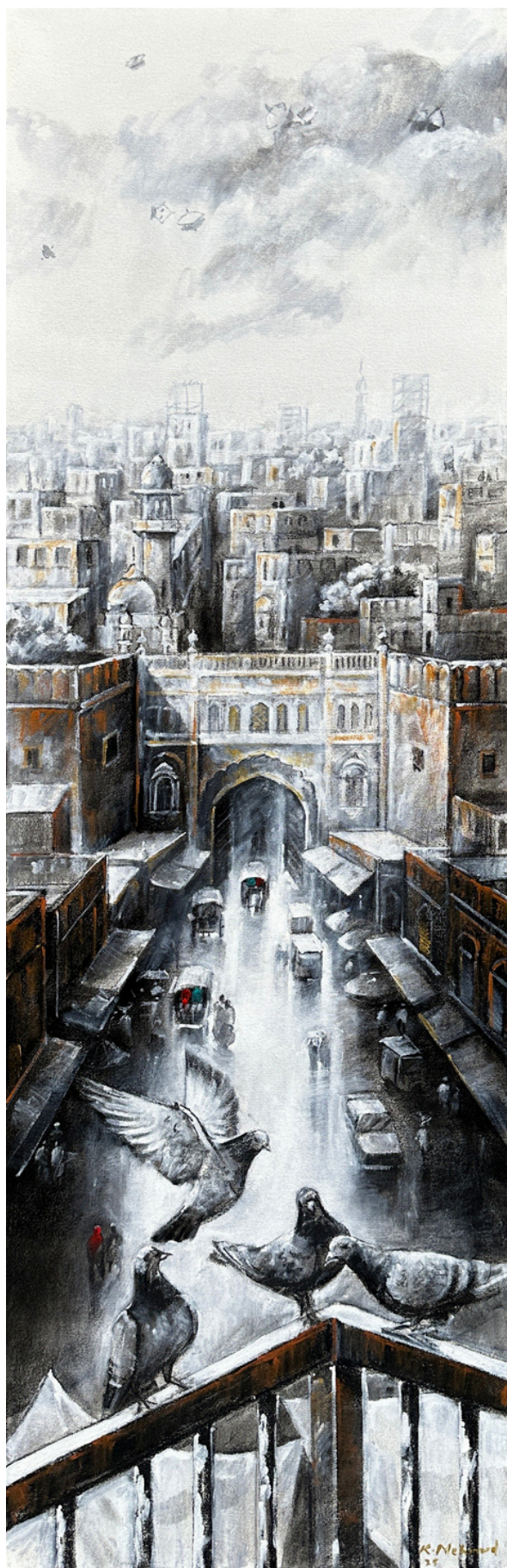
Lohari Gate: The Pigeons' View

15 x 48 inches - Charcoal & Acrylic on Canvas